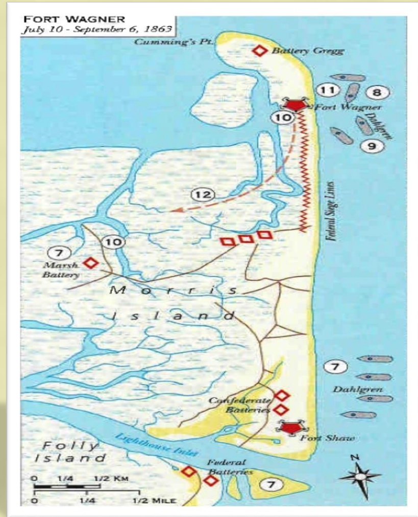
Robert Gould Shaw