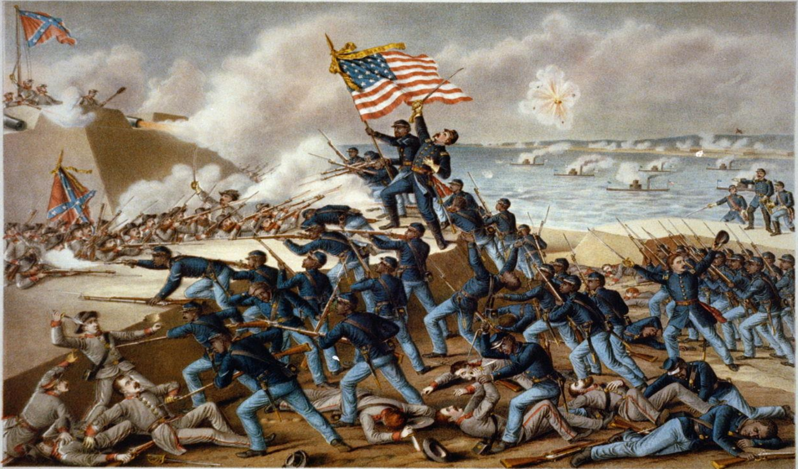
STORMING FORT WAGNER.